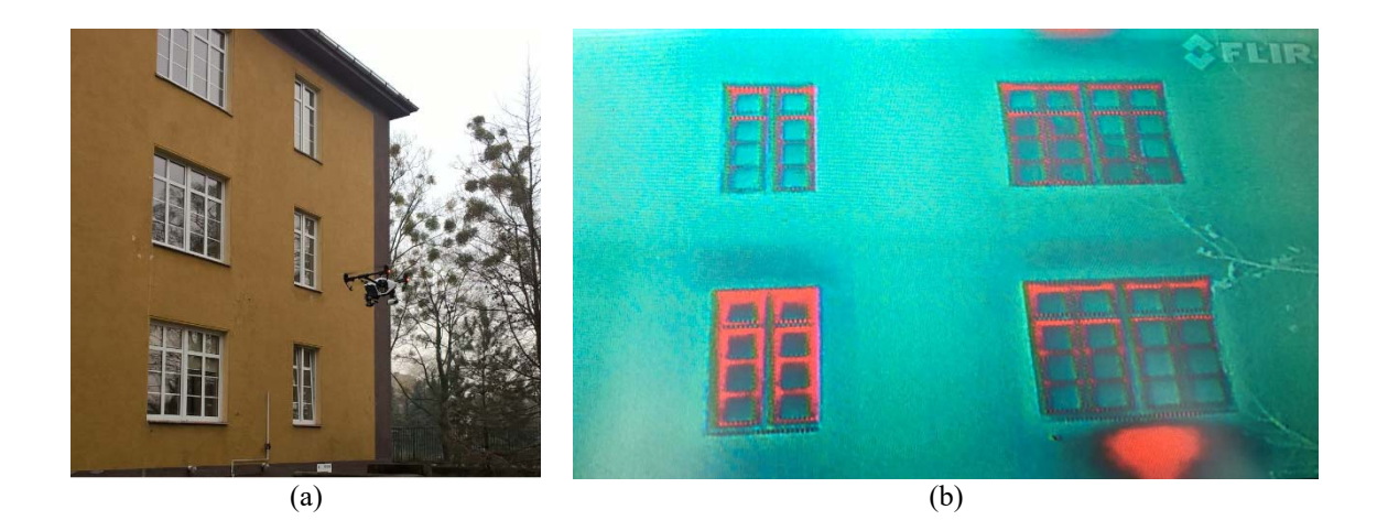
FIGURE 1.Thermal inspection of building with using an UAV. (a) Quadrocopter making a thermal inspection of building with using a thermal camera, (b) view from thermal camera